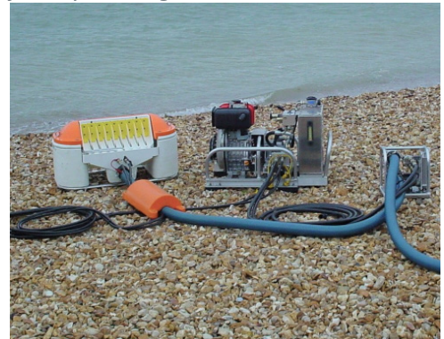
Komara Mini System